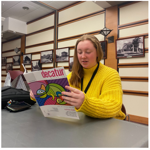
The CICEO Class was featured in Decatur Magazine!