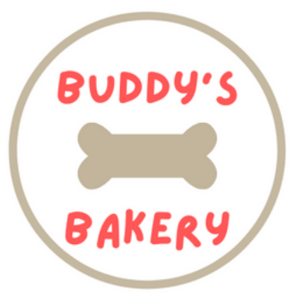
The best treats for your best buddy!